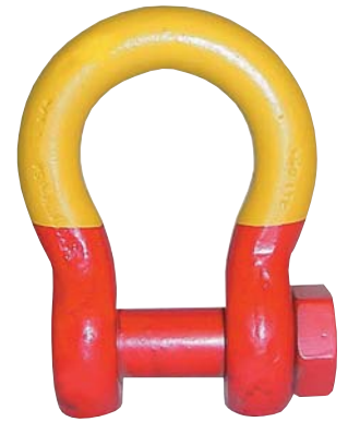
Screwpin Shackle Hex Head Pin or Marine Hex Head Available 1/2" to 4"