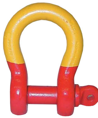
Screwpin Shackle Eyed Pin Available 1/2" to 3"