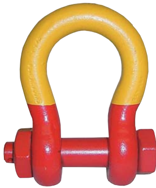
Safety Pin Shackle Available 1/2" to 4-1/2"